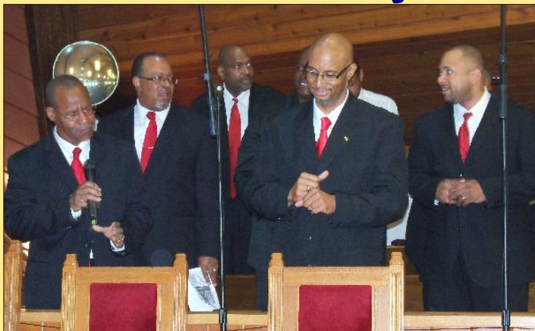
Pictured above are some members of the Men's Choir and the "Brotherhood" Ministry during Morning Worship on May 20.

This year, they are combining celebrations for Fathers Day and the Men's Annual Day, beginning on Friday, June 15, through Sunday, June 17. Their theme for Men's Day is, " Men Growing in Discipleship. " See more below.